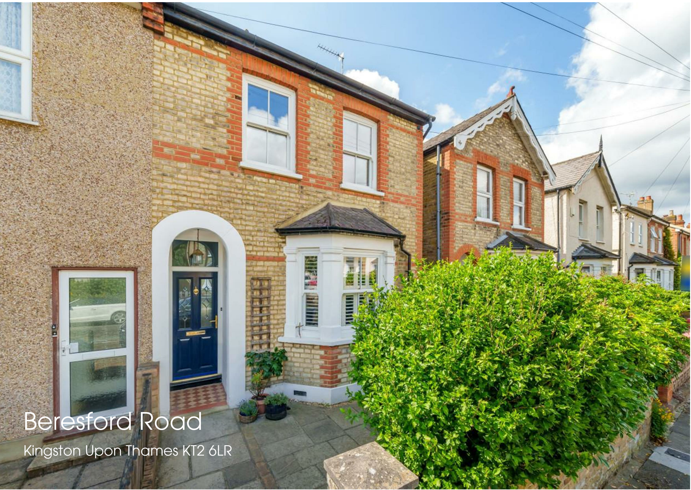
Beresford Road Kingston Upon Thames KT2 6LR

34 Richmond Road Kingston upon Thames Surrey KT2 5ED www.gibsonlane.co.uk Tel: 020 8546 5444